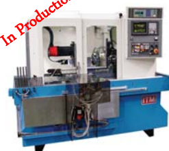
UNIVERSAL FLUTE, UFG

FLUTE GRINDING WITH CONVENTIONAL OR SUPERABRASIVE WHEELS