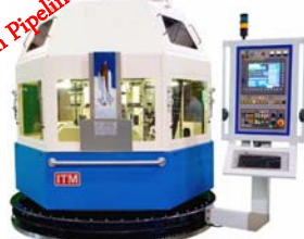
ROTARY TRANSFER, RTG

COMPLETE PRODUCTION OF TOOLS & PARTS IN UP TO 6 STATIONS