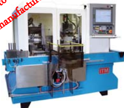
PEEL GRINDER, PPG

HSS, CARBIDE & STAINLESS BLANKS GROUND TO HIGH TOLERANCE